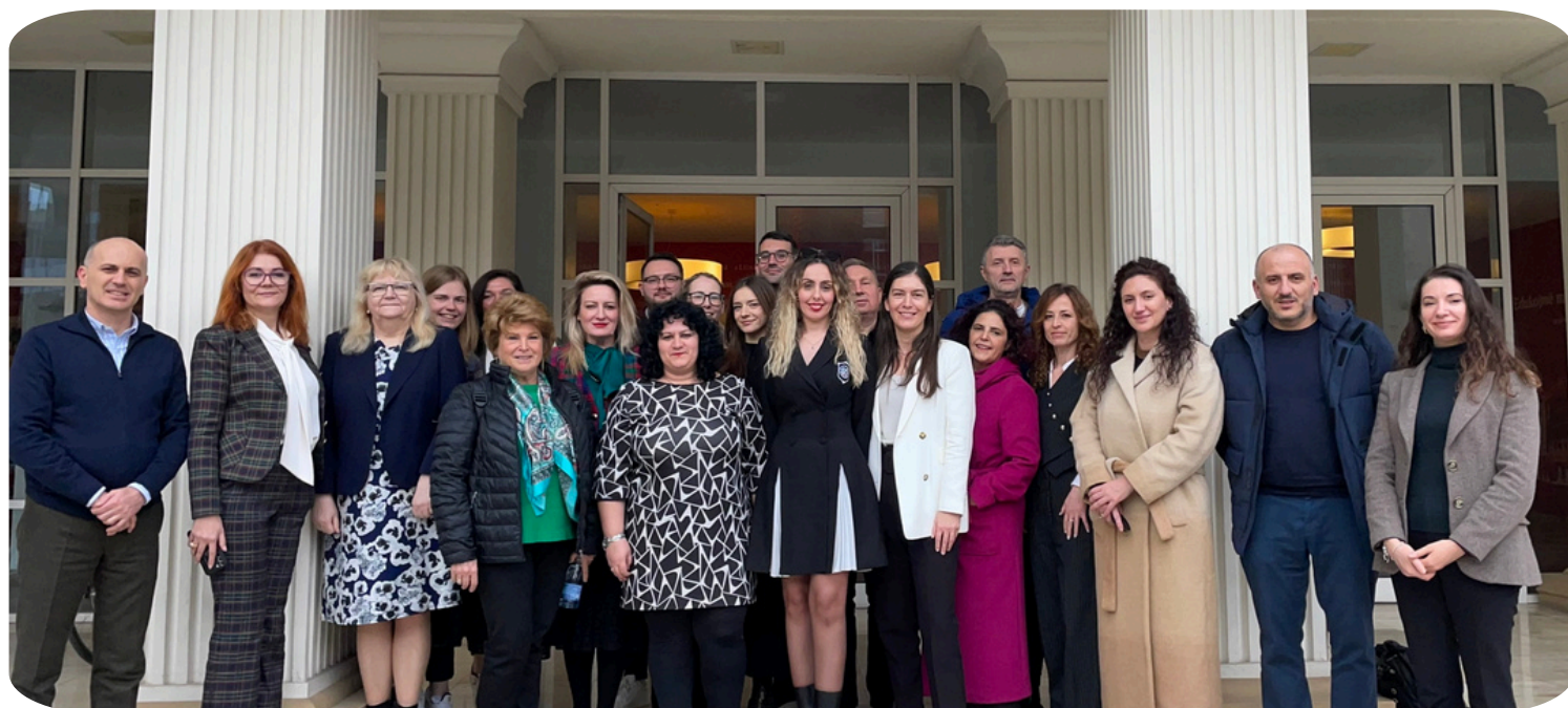
1st Transnational partnership meeting, January 2025, Albania, Tirana